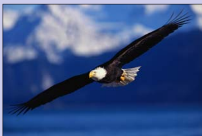
An Eternity of Endless Space: A Day of Wind and Moon

Through education, promotion and service delivery, The Misiway Community Health Centre encourages individuals, families, and communities to integrate and balance their physical, mental, emotional, and spiritual needs.